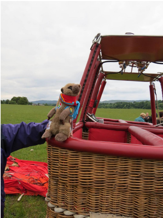
Meerkat Mozzie in hot-air balloon

Meerkats are social animals that live in large groups throughout southern Africa.. They belong to the mongoose family and are a matriarchal society. You may recognise them from our facebook logo?